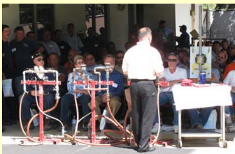
Field Test & Repair Demonstrations