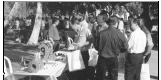
A BIG thank you goes out to all those who helped make the vendor fair a success!